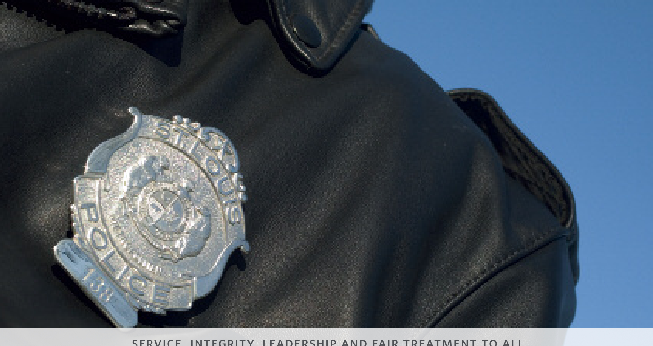
SERVICE, INTEGRITY, LEADERSHIP AND FAIR TREATMENT TO ALL